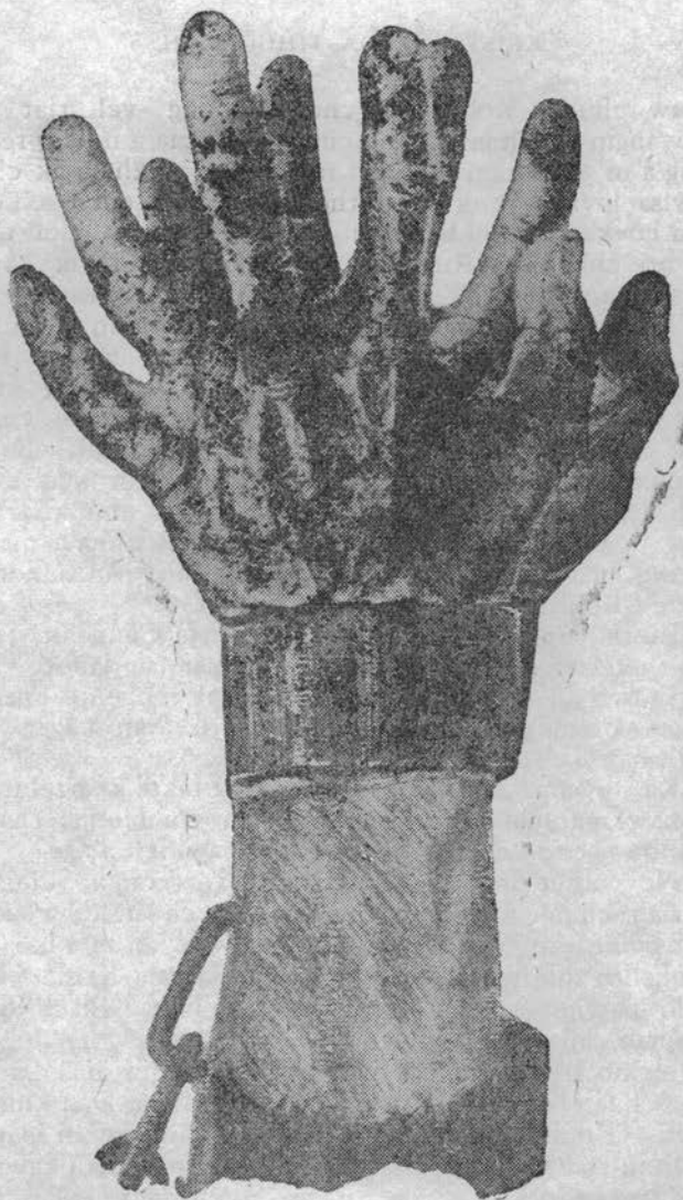
Ṭawngṭaina chuan engkim ati thei antan kan ṭawngṭai Dawn lawm ni Lalpa kan ṭawngṭai ngaithla ang che.